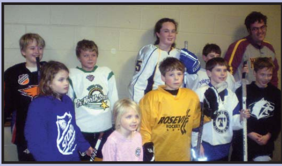
The O'Neill Grandkids - the next Generation