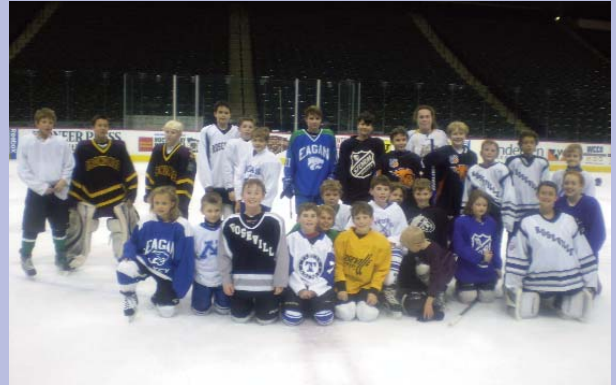
2011 Kids on Ice skaters