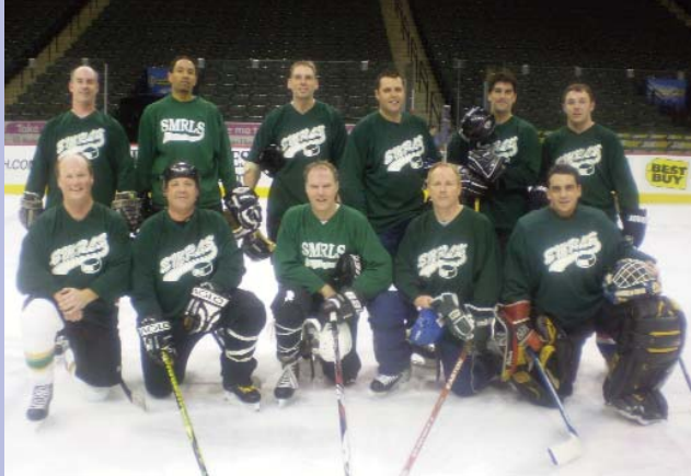
Team #2 (Green Team) Sponsored by Martin & Squires and Meagher Geer