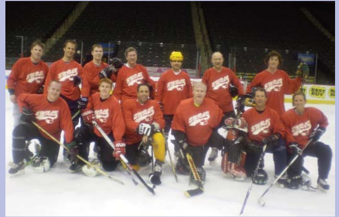
Team #1 (Red Team) Sponsored by Robins, Kaplan, Miller & Ciresi and Western Mutual Insurance Co.