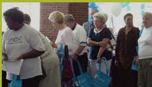
Seniors at registration

senior participants. We are extremely grateful for the support of UCare and deeply appreciate the efforts of Dorsey & Whitney and UnitedHealth Group in another successful Wills Clinic. Thank you to everyone who made the Senior Legal Fair a triumph!